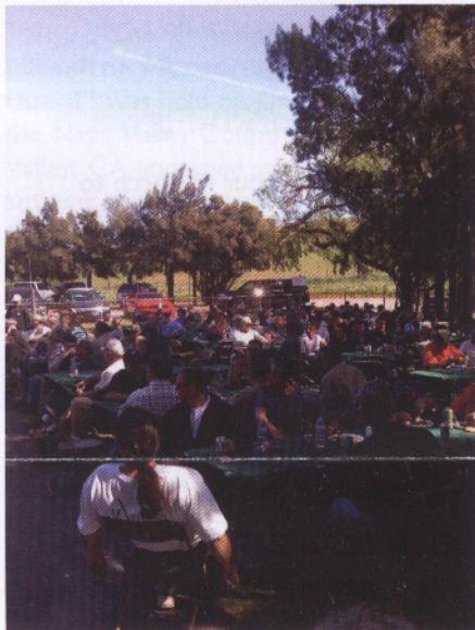
Shooters enjoying a relaxing lunch after the "Aim to Cure" event on April 9, 2010 at Birdslanding Hunting Preserve and Sporting Facility